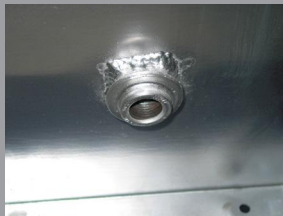
Fluid collection drain (threaded NPT)